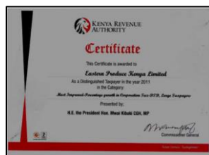
Photo 8: Copy of the certificate awarded to the Company as a distinguished tax payer in Kenya in 2011

Our Core value: - To act honestly, fairly and with integrity and respect in all business dealings. Acting lawfully and honestly is fundamental to our business philosophy. The management of each unit is responsible for compliance with the company codes, thereby ensuring that social and environmental issues are integrated into daily business. The codes are in form of confidential standing instructions referred to as Company Blue, Red, Green, Yellow, white and black books.