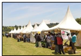
Photo 6: farmers and neighboring communities during one of the Field days

In all our businesses, employees were trained on various aspects of Human rights and their rights as employees. This included communication on their right to join a recognized workers union, right to a safe work environment and right to be considered for employment