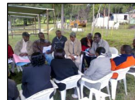
Photo 7: One of the many consultative meetings held by Management for planning purposes, grievance hearing, and monitoring and evaluation purposes

All human rights aspects are monitored on a daily basis and reported by the businesses on a Monthly basis. The Technical departments and Internal audit departments carry out impromptu visits, checks and audits and raise any issues of concern with the concerned and reports to the Top management.