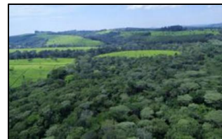
Photo 4: Aerial view of the tea field intertwined with forestry cover in a bid to enhance biodiversity.

Apart from the indigenous forests there are no other natural resources of significance in the area. No mineral resources have been found on any of the estates. Due to our environmental requirements certification by Rainforest Alliance was obtained in 2007 for the first time and recertified to date to ensure sustainable agricultural practice and sound environmental practices. To prevent any chemical degradation due to the use of pesticide the necessary precautions are taken as per the Premier foods pesticide audit.