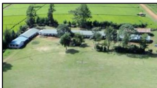
Photo3: One of the 15 primary schools constructed by the company for employees and surrounding communities' children of school going age

quality on the most favorable terms, we work collaboratively with our suppliers to ensure that availability is sustainable in the long term and that contracts are fair and business relationships are mutually beneficial.