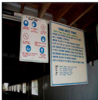
Photo 10: Safety signage within the factories promotes awareness and enhances food handling practices.

As a manufacturer and marketer of black tea, we generally do not provide products to end-users, but to other players in the industry who blends or repackages the products for the end user. We therefore base our advertisements on word of mouth backed by strong evidence of business integrity, ethical trade, and safety with assured quality. We comply with legal requirements, sector regulations and customer requirements, designed to assess product safety and also participate in voluntary initiatives.