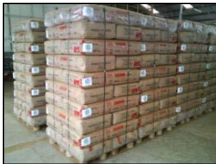
Photo 9: Hygienically packed teas with correct labeling and all relevant information indicated.

The Marketing and Technical Department represent the Company on all quality and food safety matters. They report to the Operations and Regional Directors respectively, to ensure the promotion of awareness of legal, regulatory and customer requirements throughout the organization.