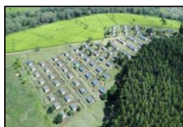
Photo 2: Aerial view of employees housing units in our estates in Nandi Hills

EPK directly supports over 8,000 jobs in a wide variety of positions involving tea plucking and tea bush management, specialist skills, different crafts and the full range of business activities and machinery operation in the tea factories. However, the people depending on our business for their livelihood are much more than listed above.