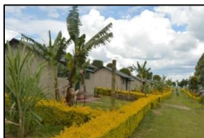
Photo1: Employee housing units in one of our estates

We believe that good management of employment, community and environmental issues is essential in ensuring the long-term success of our business.